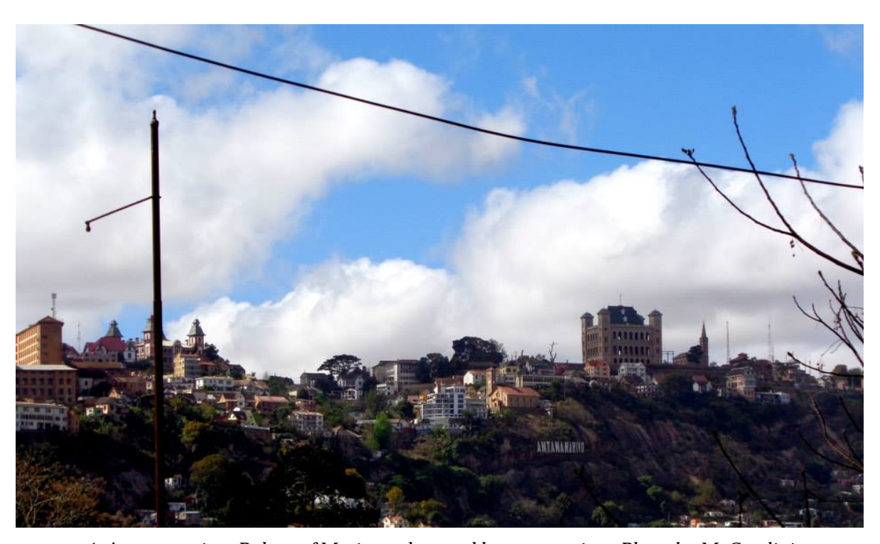
1. Antananarivo: Palace of Merina rulers and hauts quartiers.