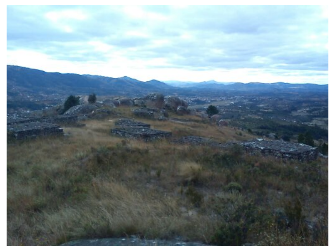
3. Ancient andriana tombs near Ambositra.

What Rakoto knew, but was systematically forgetting in order to essentialize the category of andevo, was that many of the slaves were not of African origins but people enslaved on the island during the frequent raids that characterized the centuries of the slave trade or who became slaves as punishment for crimes and debts. The "great sin" that he imputed to the andevo was of being ready to ally themselves with external powers: in other words, to be traitors. His nostalgic view of the precolonial past made him say that slavery was a good thing, that the power of the Merina nobles was benign and was a source of stability and social union for the country, and that all Madagascar's problems resulted from the rise to power of those he called "slaves" who then sold the country to colonial or neo-colonial powers.