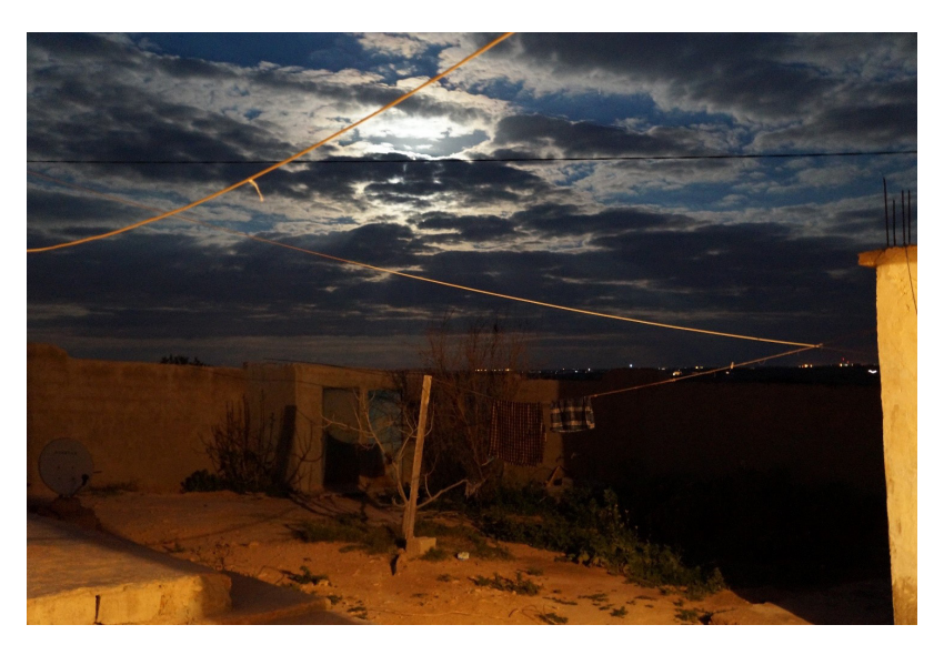
3. Internal courtyard of a house in Gosbah at dusk.