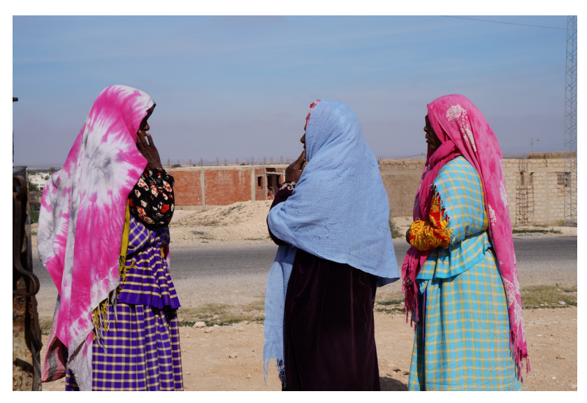
1. 'Abid Ghbonton women, waiting for the trucks on the main road of Gosbah.