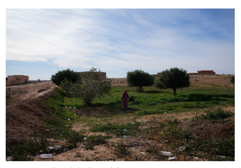
2. A woman working the land in Gosbah.