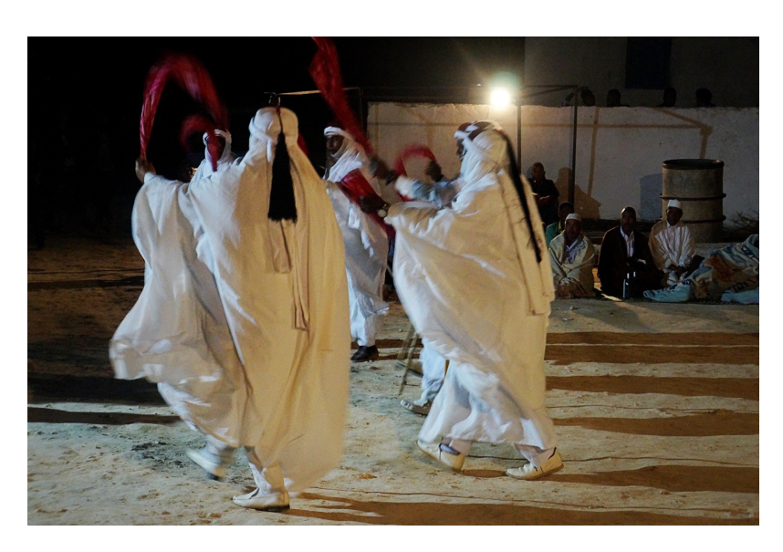
6. Tayfa singers dancing and waving the red neckerchief.