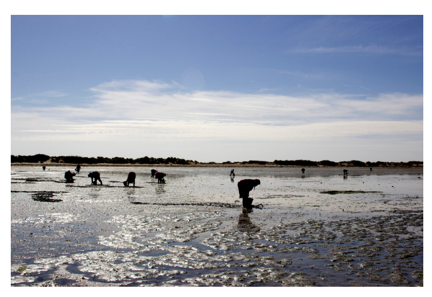
8. Women collecting babūch (clams).