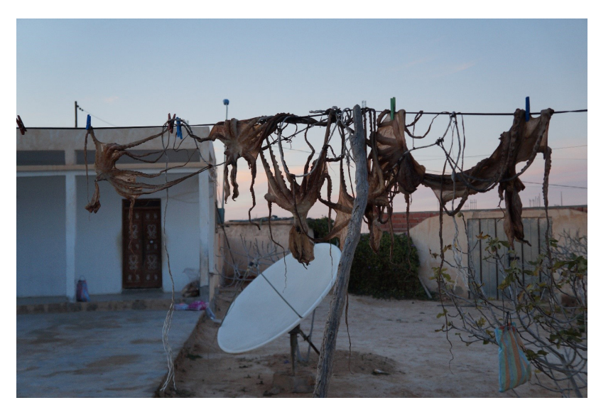
7. The courtyard of a house in Gosbah, with octopuses hanging to dry in the sun.