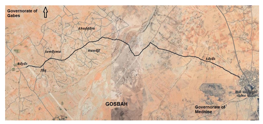
10. The village of Gosbah.