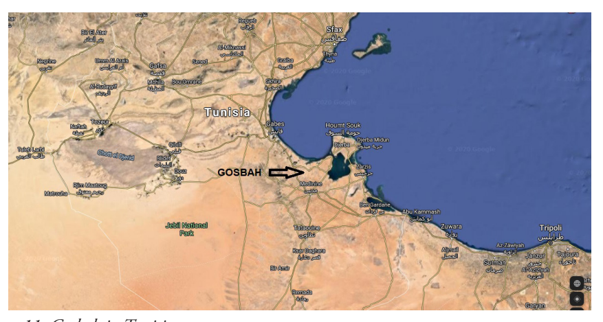
11. Gosbah in Tunisia.