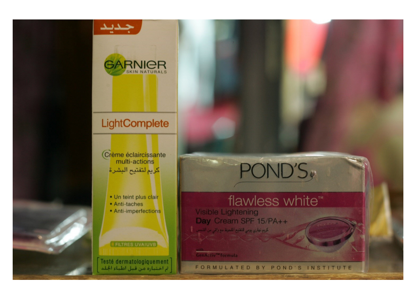
4. Skin-whitening creams. Market in Gabes, southern Tunisia.