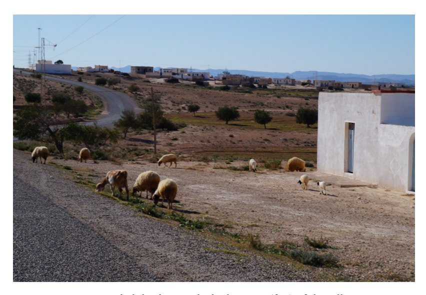
9. Main street in Gosbah leading to the higher part (fūq) of the village.