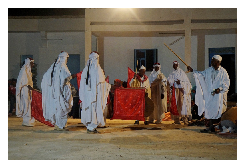
5. Tayfa singers performing at a wedding in Gosbah.